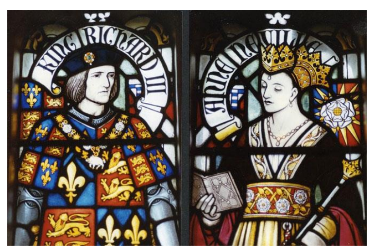
Richard and Anne: stained glass window in Cardiff Castle

The statements regarding Richard's actions and appearance on the morning of Bosworth are matters of importance in that they show a considerable strain which would, under the circumstances be only normal and typical of any man under the stress of a similar set of circumstances. Since he doesn't seem to have been too worried about it himself, one can only assume that it was apparently something to which he was accustomed. Apart from the actual treason of the Stanleys and Northumberland there are a number of symptoms evident that do point to another very good reason for this condition. The Croyland Continuator says that Richard spent a sleepless night and adds that at daybreak his drawn features were even more livid and ghastly than usual, that there were no chaplains present to perform divine services for the king, nor any breakfast prepared to