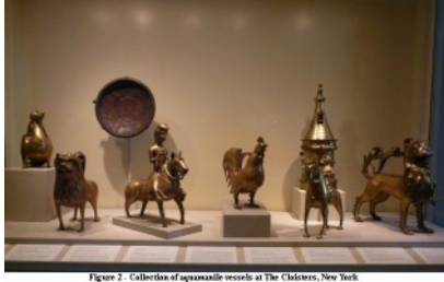
14 at 2 - Constant apartons research in Constant (see feet

A nobleman always washed his hands before and after eating a meal—not to do so would have been considered bad manners. During banquets,