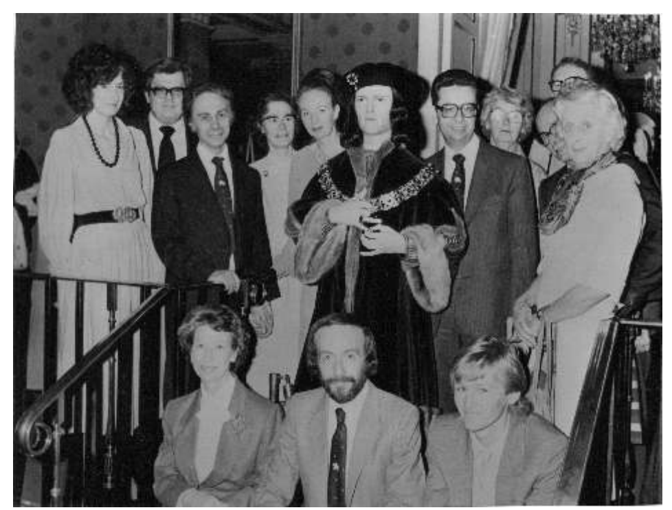
Figure 12: "My committee and I: . . . " 1985 Committee of the Richard III Society around the newly installed figure of the King at Mme. Tussaud's