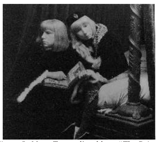
Figure 8: Mme. Tussaud's tableau "The Princes in the Tower" — after the painting by Paul Delaroche

Although surviving well into the sixties, it was inevitable that in due course such displays would be per-