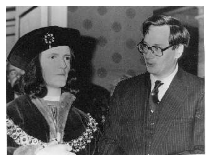
Figure 11: HRH Prince Richard, Duke of Gloucester, patron of the Richard III Society, scrutinizes the newly installed figure of the king at Mme. Tussaud's,

A much reduced 'Hall of Tableaux' survived, and in 1979 new figures, by Allan Moss, of the 'Princes in the Tower' were introduced (Fig 8 and Cover) but this time from a less contentious source, being based on the 1813 painting by Paul Delaroche, of which the original is in the Louvre, with a smaller copy in the Wallace