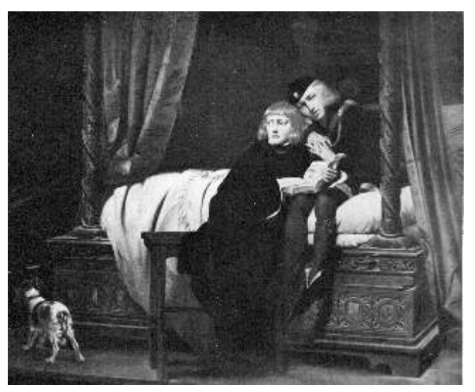
Figure 9: The Princes in the Tower (Les Enfants D'Edouard). Paul Delaroche (1831)

ceived to be dated, and out of fashion, given the ever-increasing rise of popular culture, to which Tussaud's responded by introducing 'The Entertainers' and 'Heroes Live!' though one concession to British history was the 'sound and fury' of the Battle of Trafalgar (1966).