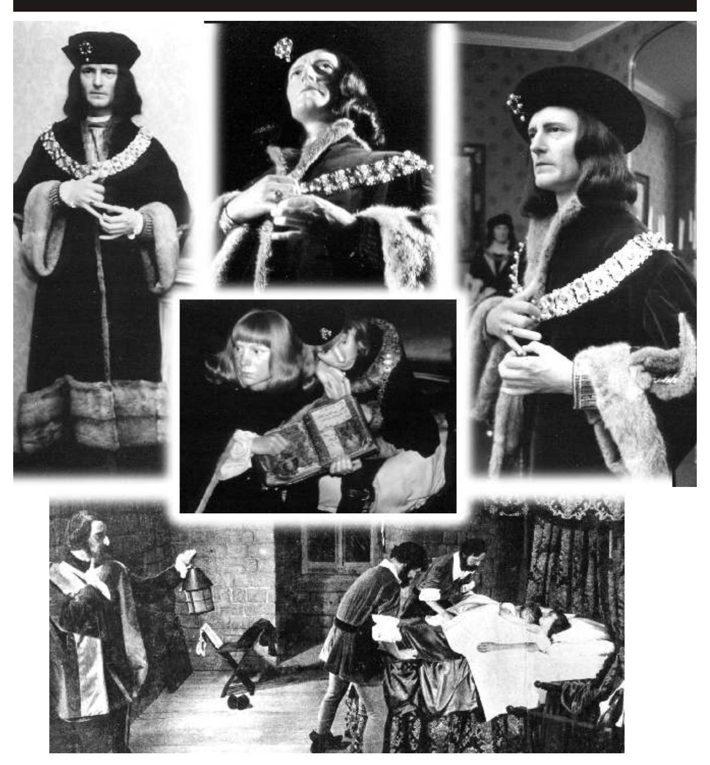
The Easy-Melting King