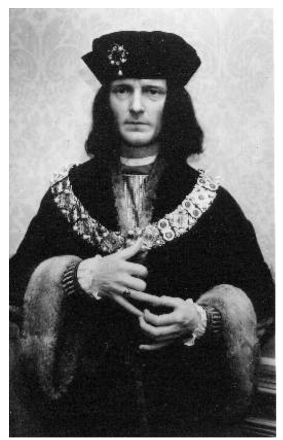
Figure 10: Detail of Mme. Toussaud's figure of Richard III, installed in 1985

Eventually the old 'Hall of Kings' was dismantled and its figures removed, though contrary to popular belief and anecdote, the wax heads and limbs are not usually melted down, but carefully preserved, along with the original models and casts, at what was to become another tourist attraction, the storerooms at Wookey Hole, in Somerset, described as the exhibitions' 'limbo'. Here, among the serried ranks of disembodied heads, the features of Richard III and Edward V, can be identified in this enlargement from a contemporary magazine photograph (Fig 7).