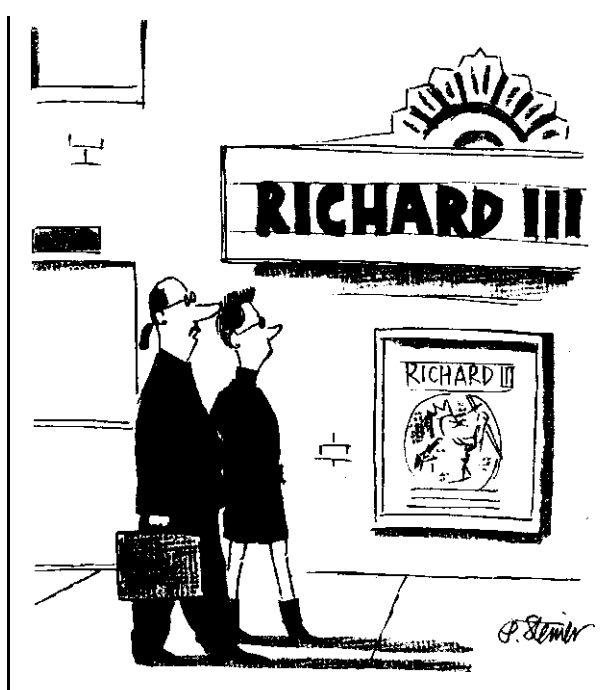
"Personally, I'm getting sick of se quels."