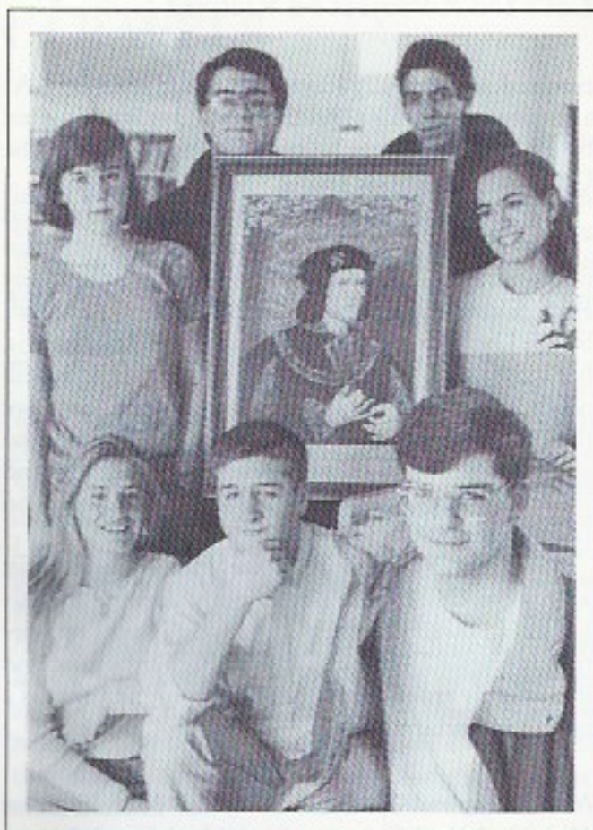
North Kingston High School students display the NGP Portrait of Richard III