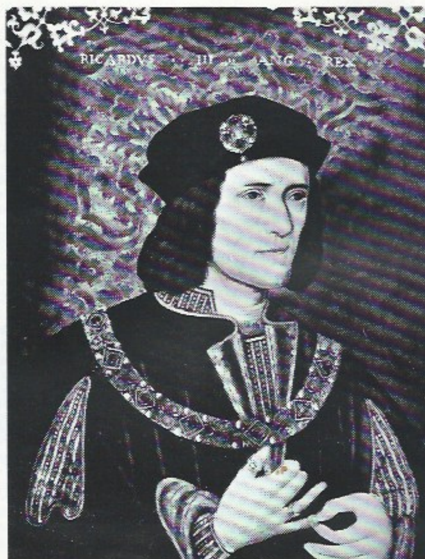
National Portrait Gallery, London

RICHARD III: A MAN OF HIS TIMES Annual General Meeting October 1-3, 1993 Newark, New Jersey